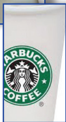
Starbucks Caffé Latte $24.32