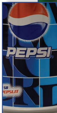
Pepsi Cola $3.47