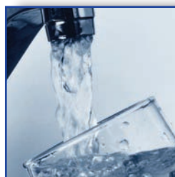
LVMWD water $0.0033

And remember, LVMWD water is delivered dependably and safely to your home, every day of the year through an extensive system of pumps, tanks and pipes, most of it hidden from sight.💧